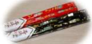
Wakasa Lacquered Chopsticks