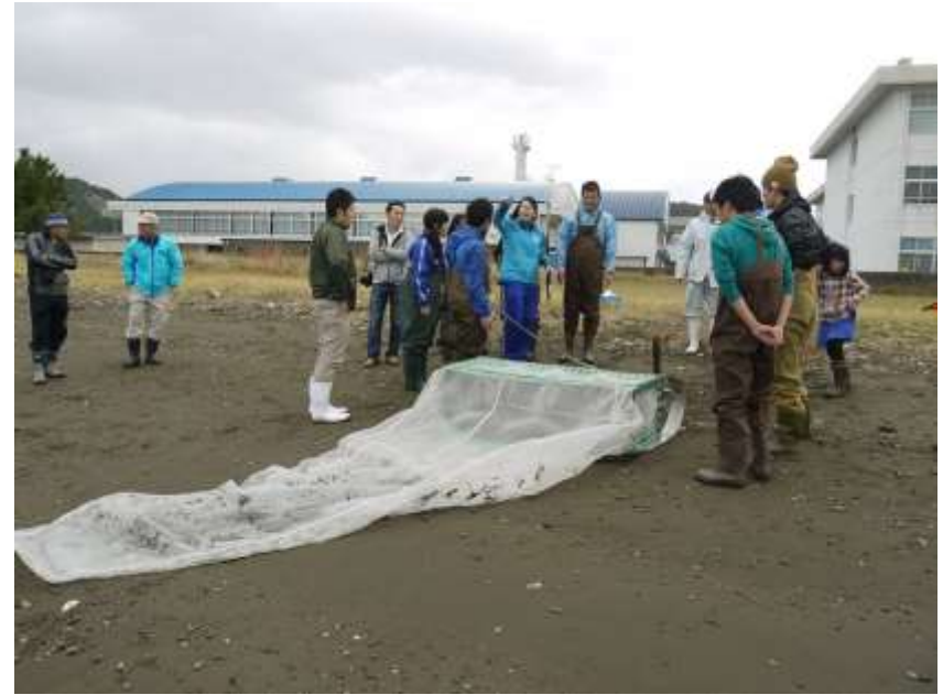
Investigation of the biodiversity in shallow sea area

The members visit each fishing village in Obama, interview local residents and research their problems.