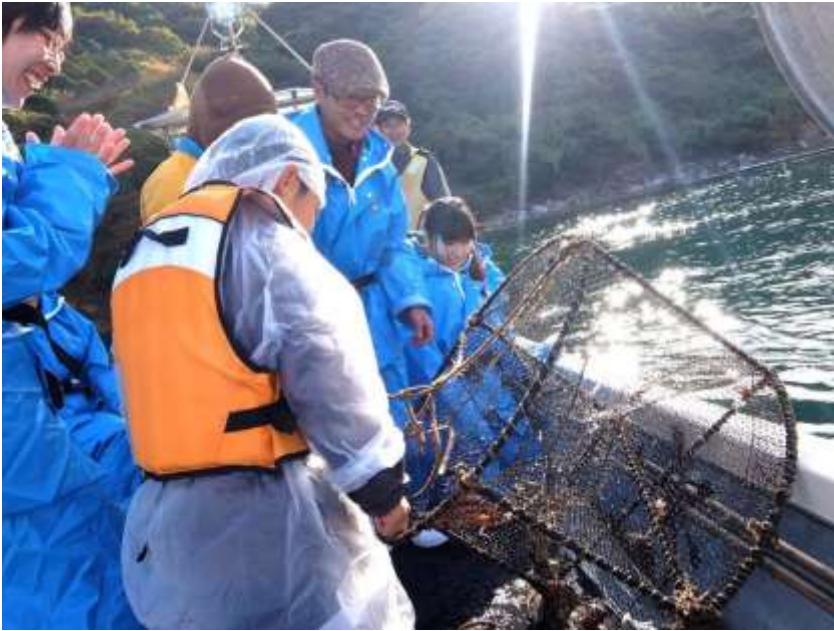
Visit to fishing villages

The members visit each fishing village in Obama, interview local residents and research their problems.