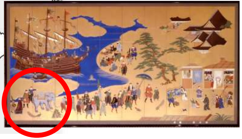
Obama is the first place where elephant came in Japan.